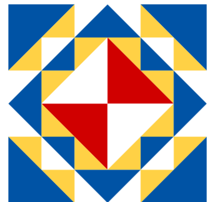
Corn & Beans