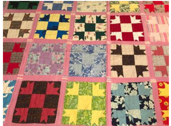
Sarah Lee's quilt is made from a pattern named Turkey Tracks or Chicken Tracks. This pattern would make an excellent barn quilt, since its simple design will show up well on the barn, which is placed a distance from the road.