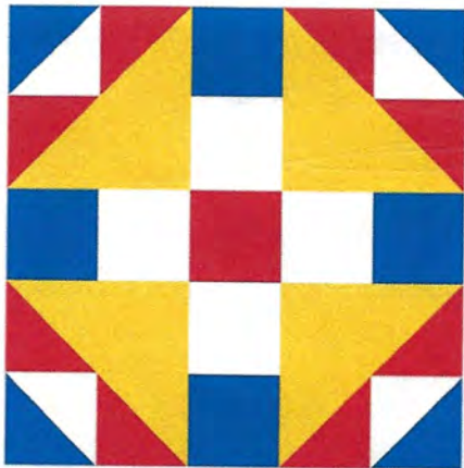
1. Duck and Ducklings