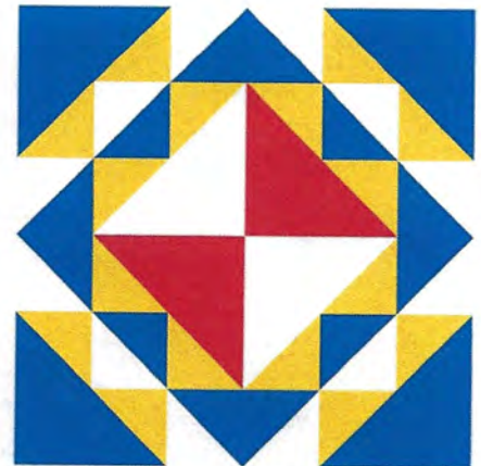
3. Corn and Beans