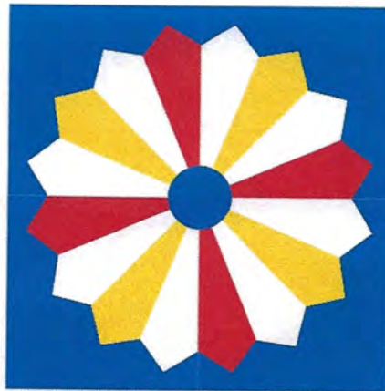
2. Dresden Plate